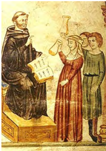
Figure 1: Costantino l'Africano

The nascent school also referred to the medical cultures of the time to lay the necessary foundations to then be recognized throughout the world and thus also initiate the birth of universities in Italy and in the rest of Europe. In Salerno, in the 9th century, there was a great legal culture, an ecclesiastical school but also a few scholars, who taught the dogmas of the art of health (Figure 1).